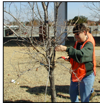
Receive hands-on pruning experience!

The Citizen Forester program is open to interested adults living in the 17 county region in North Texas that makes up the Cross Timbers Urban Forestry Council, including Tarrant, Denton, Cooke, Montague, Clay, Wichita, Archer, Young, Stephens, Palo Pinto, Erath, Somervell,