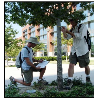
Conduct street tree inventories!

To request an application, call 817-392-5738 or visit the Cross Timbers Urban Forestry Council's website, ctufc.org