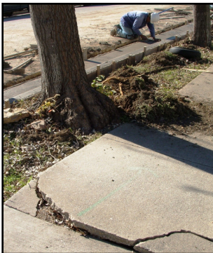
Learn about managing trees in urban environments!