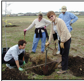
Practice proper planting techniques!

Trained to plant, prune and properly maintain trees in an urban environment, Citizen Foresters are involved with many projects, including assisting with tree inventories, training and pruning newly established trees, measuring street trees for clearance, mulching trees in public parks, and participating in public tree planting programs and tree give-away events.