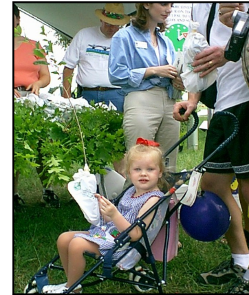
Assist with public tree give-away events!

Traditionally, Citizen Forester classes are held in Fort Worth from 9 a.m. to 4 p.m., once or twice a month from January to June. This schedule is subject to change.